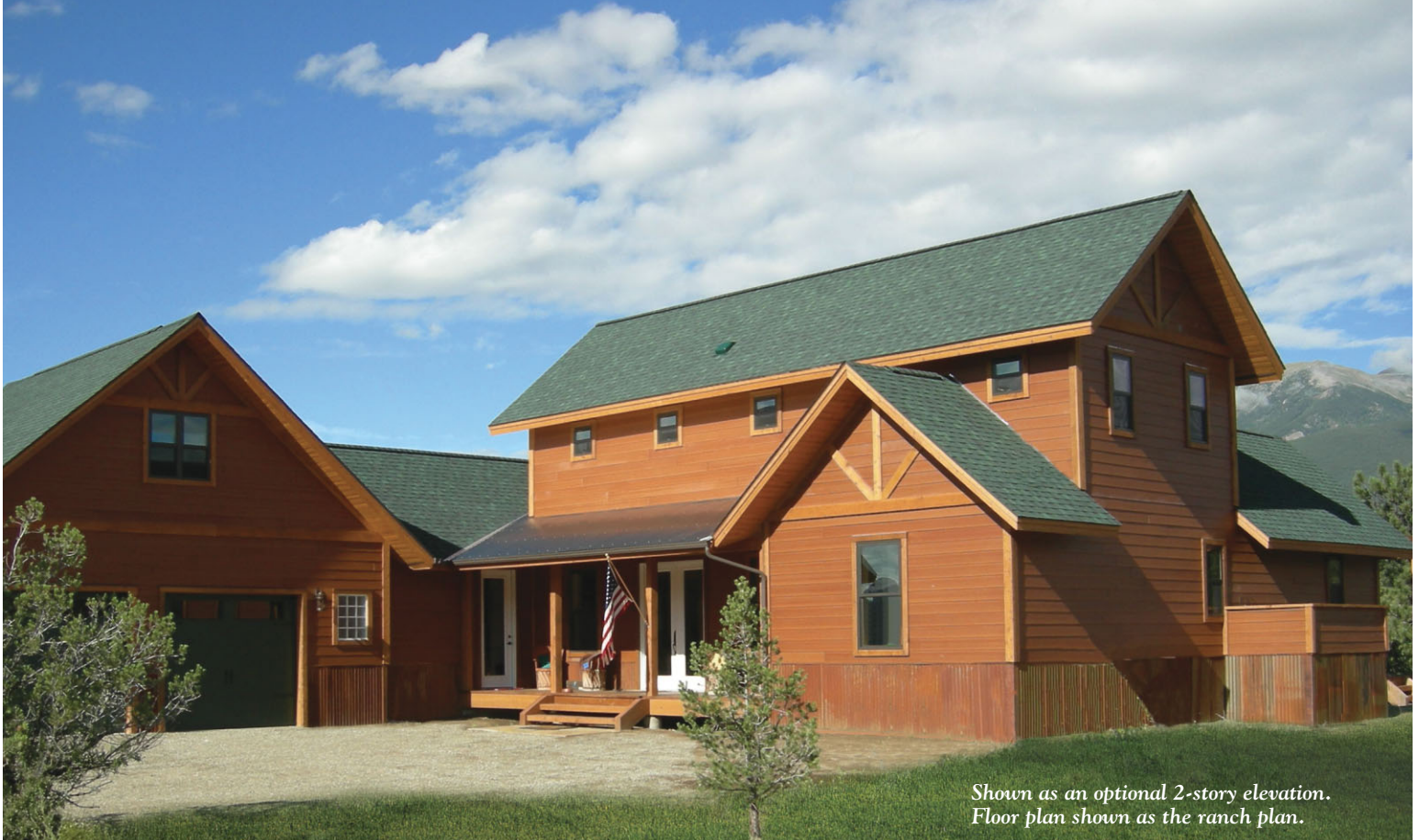
Shown as an optional 2-story elevation. Floor plan shown as the ranch plan.